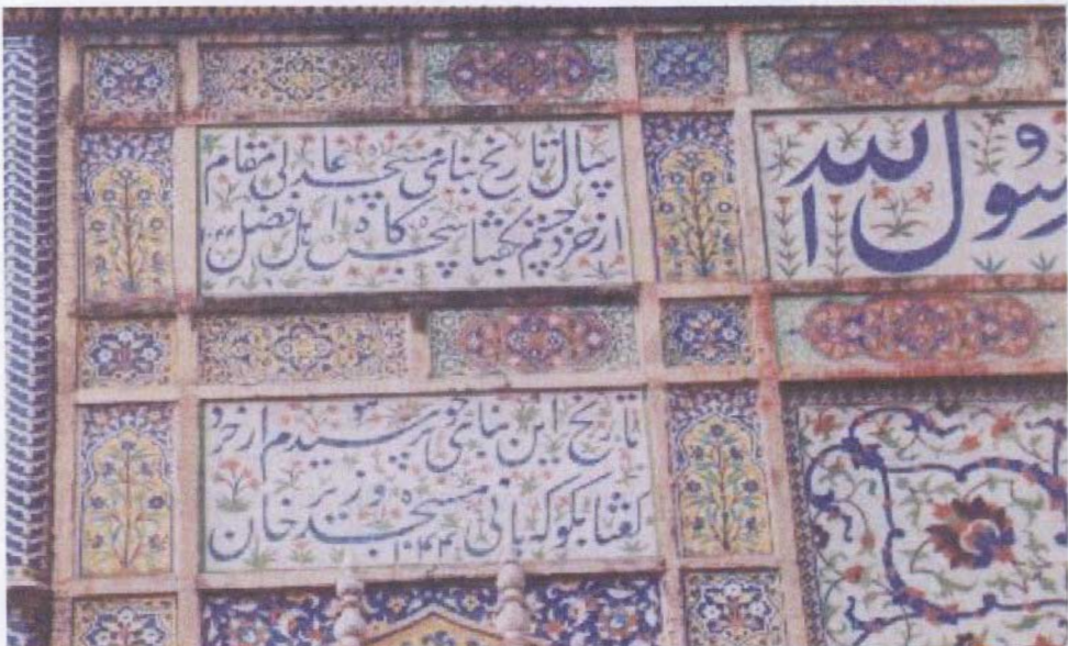
Choronograms on the facade of Wazir Khan Mosque